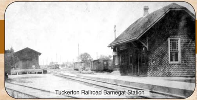
Tuckerton Railroad Barnegat Station